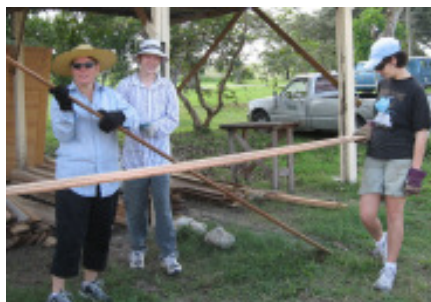
Measuring out the siding for the walls.

Thank You Church Family!!! For Your Prayers and For Your Financial Help in Making The Belize Mission Trip Possible. You Helped make a dream come true for the Belizians we were able to help and the McDonald Road Youth who were able to be a part of this special mission opportunity.