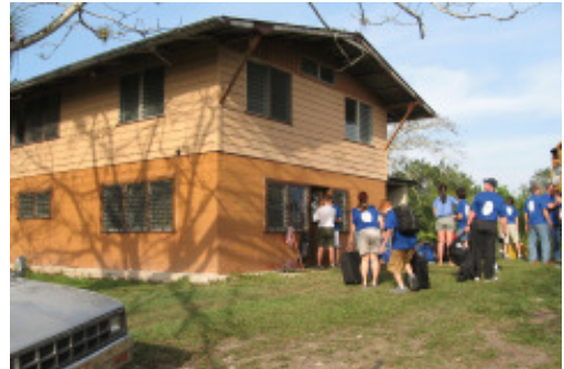
Our house where we stayed at La Loma Luz Adventist Hospital in San Ignacio, Belize