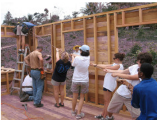
Everybody pull! The walls of the house came up in no time with everyone working together.