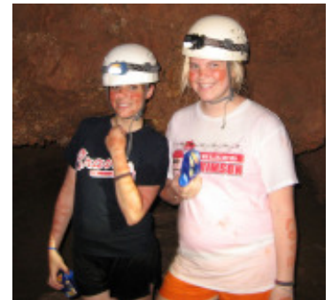
We worked hard and we played hard...visiting a Mayan Cave and snorkeling at Caye Caulker...the world's second largest barrier reef.