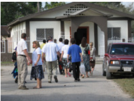
The Seventh-day Adventist church where we celebrated our first Sabbath in San Ignacio, Belize.