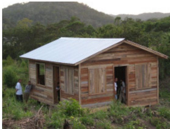
After: The new one-room house the mission team built in San Antonio, Belize for the Romas children.